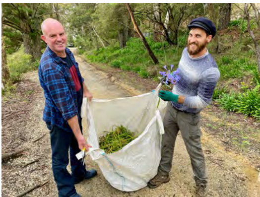
Dead-heading agapanthus and installing nesting boxes around Blackheath Community Farm

Numbers will be limited so contact Lis if you'd like to join in on 0407 437 553.